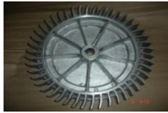
HRST#2 DUCT IMPELLER