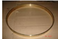
CASING / WEARING RING