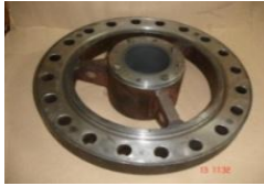
SPIDER WITH CARBON BUSH