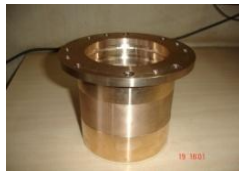
CEP THROTTLE BUSH