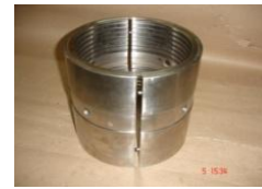
PAC THROTTLE SLEEVE