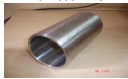
HEAD SHAFT SLEEVE