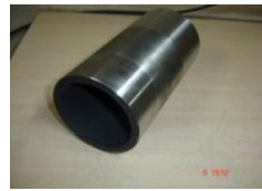
CARBON BEARING BUSH