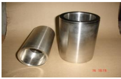
ACID PUMP SHAFT&SLEEVE