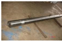
COOLING WATER PUMP SHAFT