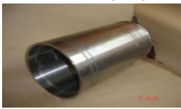
PAC LOWER SHAFT SLEEVE