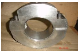
SO 2 BLOWER JOURNAL BEARING