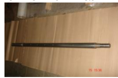
INTERMEDIATE SHAFT SLEEVE