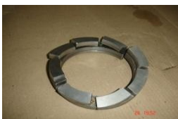
SO 2 BLOWER THRUST PADS