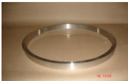
IMPELLER WEAR RING