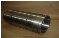
PAC UPPER SHAFT SLEEVE