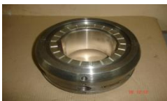
FF FAN BLOWER BEARING